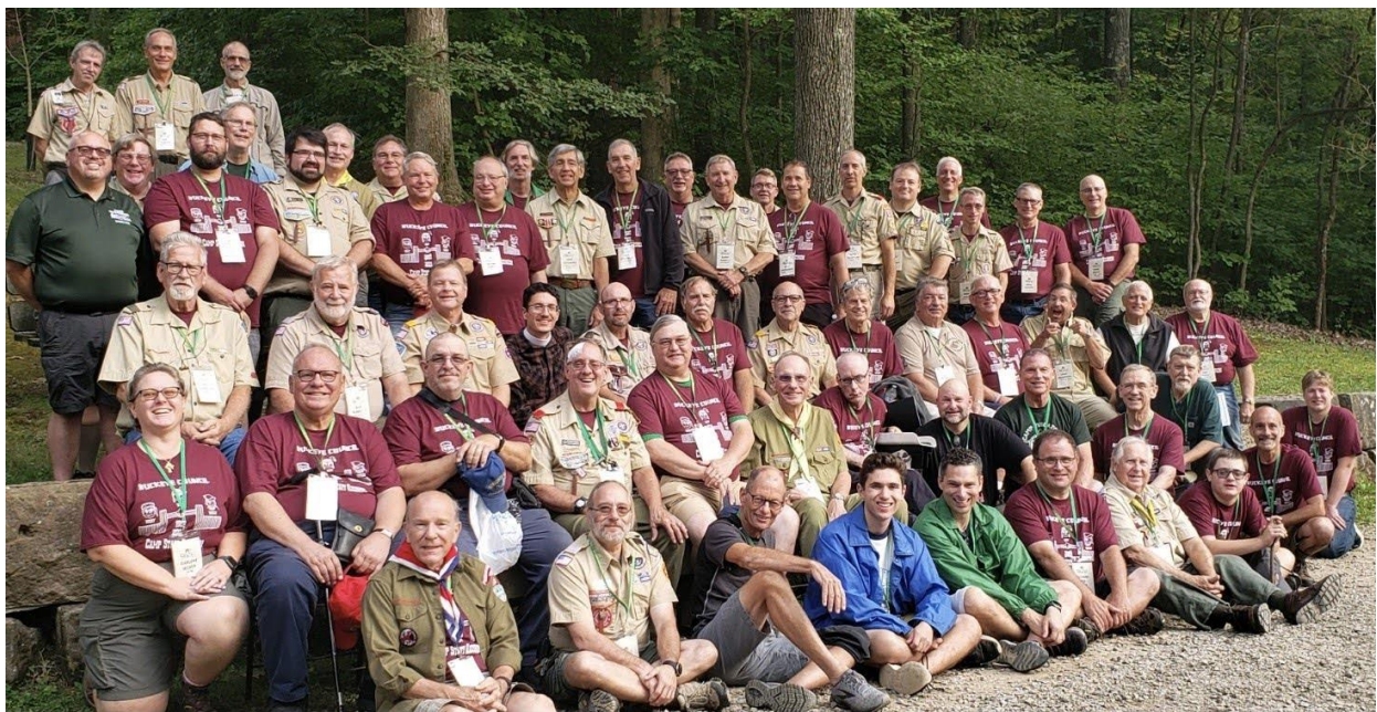
Camp Tuscazoar Staff Alumni Reunion – Dover, Ohio

Helping You Organize a Successful Reunion!