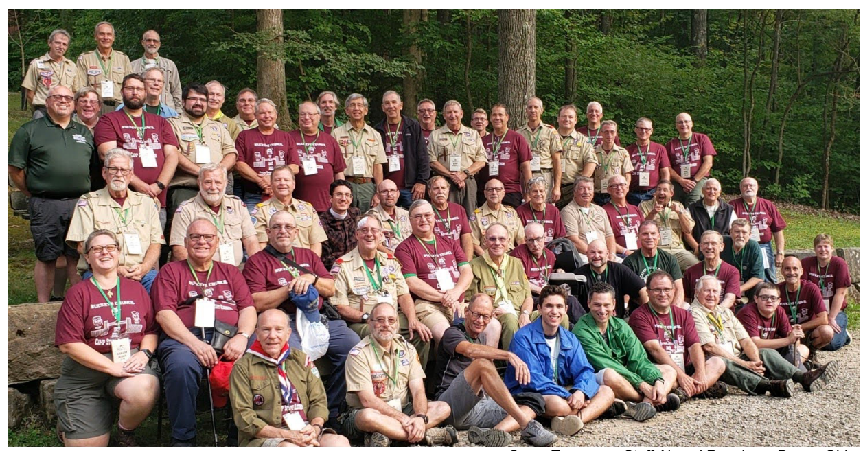
Camp Tuscazoar Staff Alumni Reunion - Dover, Ohio

Helping You Organize a Successful Reunion!