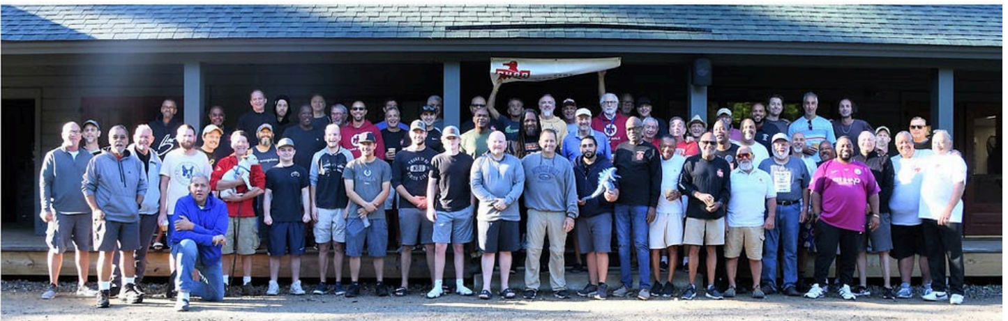
(Camp Hale Alumni Association)

"Encouraging and Assisting Councils with Developing a Camp Alumni Association!"